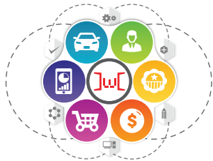
Webbula's Data Taxonomy is comprehensive

Webbula's dataVault is cloudHygiene rated and pulled from over 110+ trusted sources, providing unparalleled accuracy that thousands of brands, organizations, and agencies depend on.